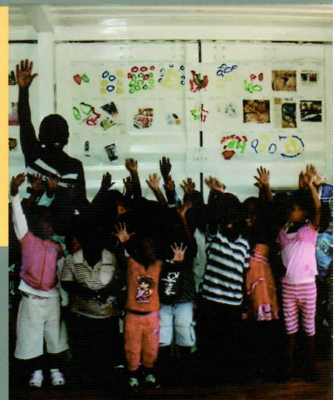
Photo: Children in a school converted from a container in a South African shanty town assisted by funds from CSTWF

If you are not already a member of the fund or if you know someone who might be interested in joining, please contact us immediately or go to our website www.cstwf.ie for more information and application forms.