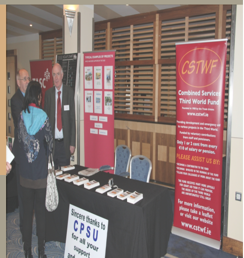
Volunteers man the CSTWF stand at a union annual conference

If you are not already a member of the fund or if you know someone who might be interested in joining, please contact us immediately or go to our website www.cstwf.ie for more information and application forms.