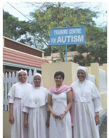
Photo: A physiotherapist and helpers at an autism centre for children in Cochin Kerala assisted by funds from CSTWF

If you are not already a member of the fund or if you know someone who might be interested in joining, please contact us immediately or go to our website: www.cstwf.ie for more information and application forms.